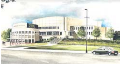
Franklin County Veterans Memorial