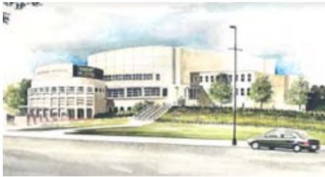
Franklin County Veterans Memorial